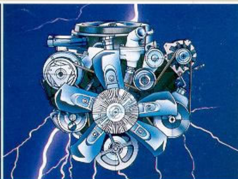
6.2 Liter V8 Diesel Engine