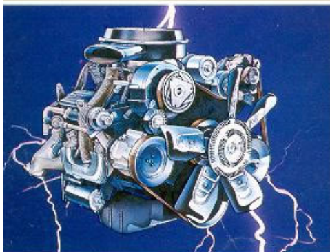
4.3 Liter Vortec V6 Gasoline Engine