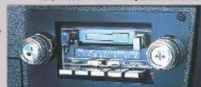
Delco AM-FM stereo radio with cassette deck.