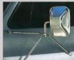
Stainless steel outside camper mirror.

10 Series Suburban 2WD with optional Exterior Decor Package in Light Blue Metallic and Midnight Blue. Shows with optional deep-tinted glass and dealer-installed luggage rack and hitch platform.